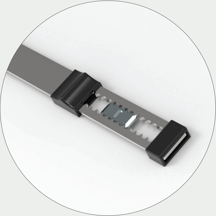
Off-set extension bar - a single extension bar will increase any shootbolt extension by a maximum of 450mm (extra intermediate transmission guides will be required).