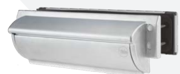
Brushed Silver Effect