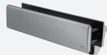
Brushed Silver Effect