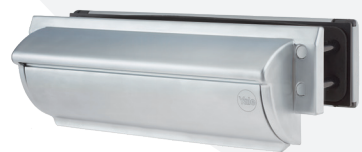
Brushed Silver Effect