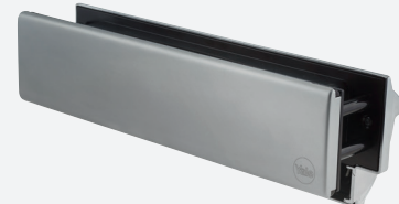
Brushed Silver Effect